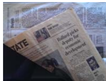
Light damaged newspaper

As for how long this lifespan may be, that depends on many factors – your storage environment; the amount of light and other environmental factors in your exhibit space; and the fibers, dyes, inks and what have you that make up the object